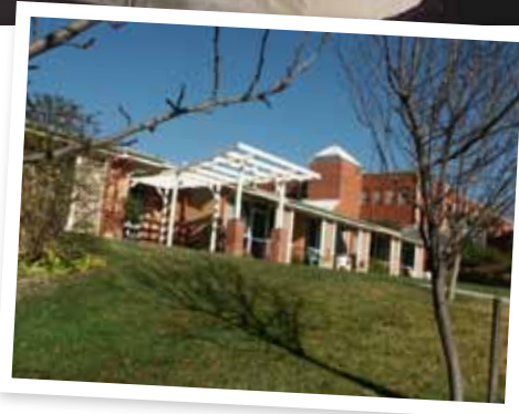
Above: Macquarie Care Centre Inset: St Catherine's Aged Care

"The managers and staff at Better Practice Award-winning homes are going above and beyond in providing the very best care for their residents, and in many cases, residents themselves are active participants in these innovative programs."