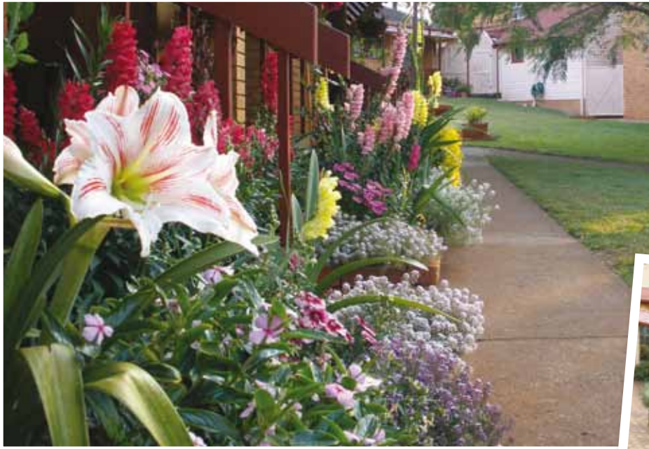
Gardens at Ozanam Villa, Lismore

It was quite an honour for the residents of Ozanam Villa to take out first prize in the 2011 Lismore Garden Club Spring Garden Competition. Competing in the category for Business, Factory, Hospital or Church, Ozanam Villa was a clear winner and the picture below shows why!